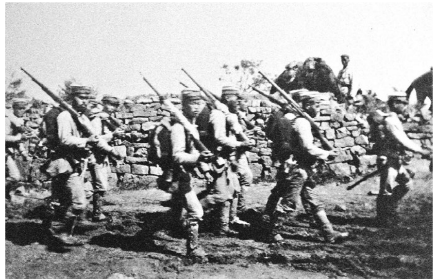
Japanese Soldiers, 1904